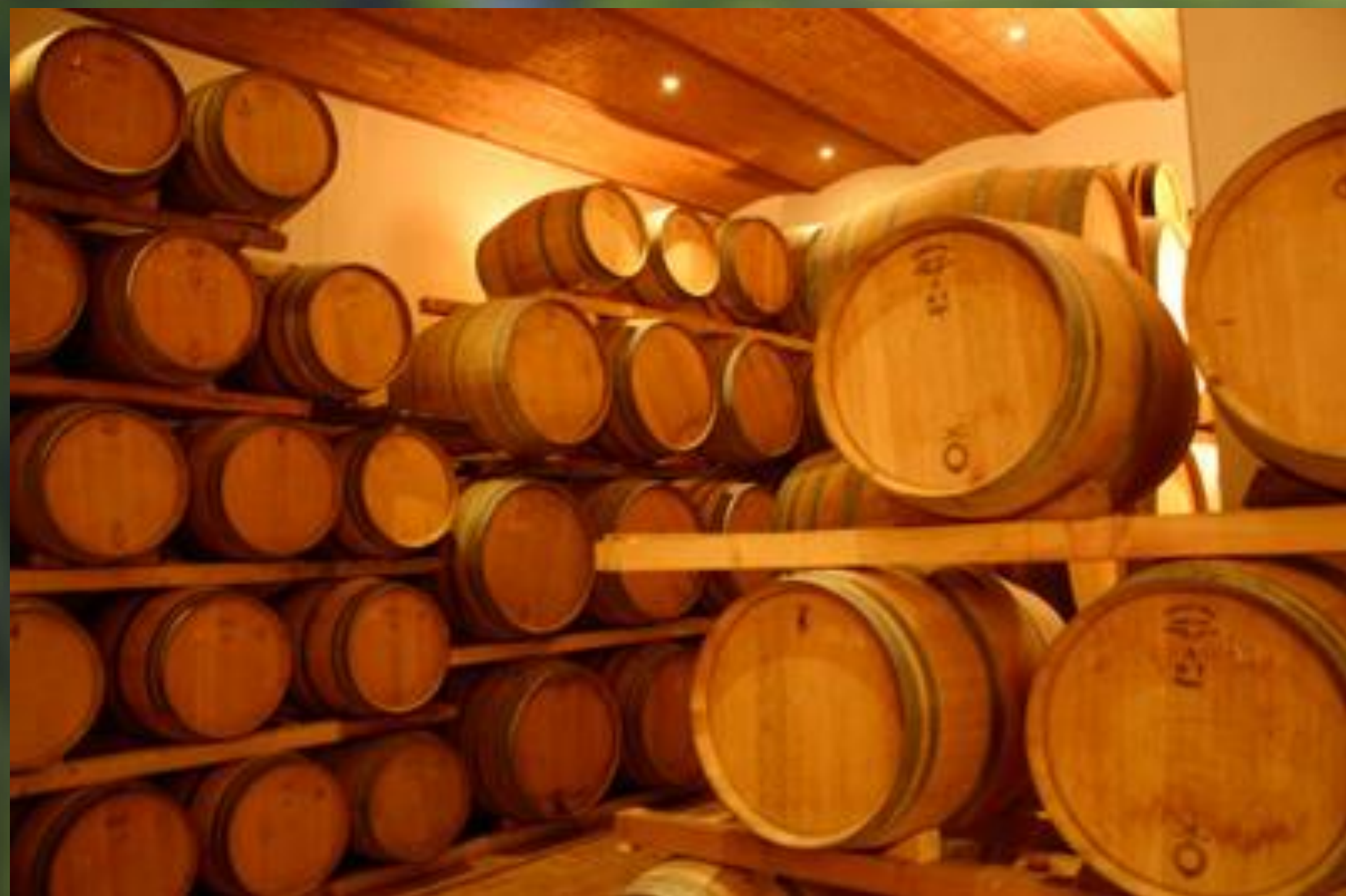
Nine hundred gallons of olive oil