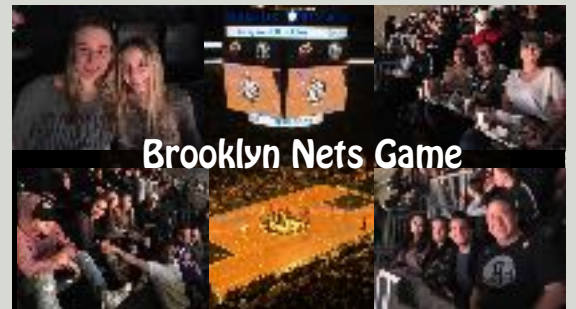
Brooklyn Nets Game