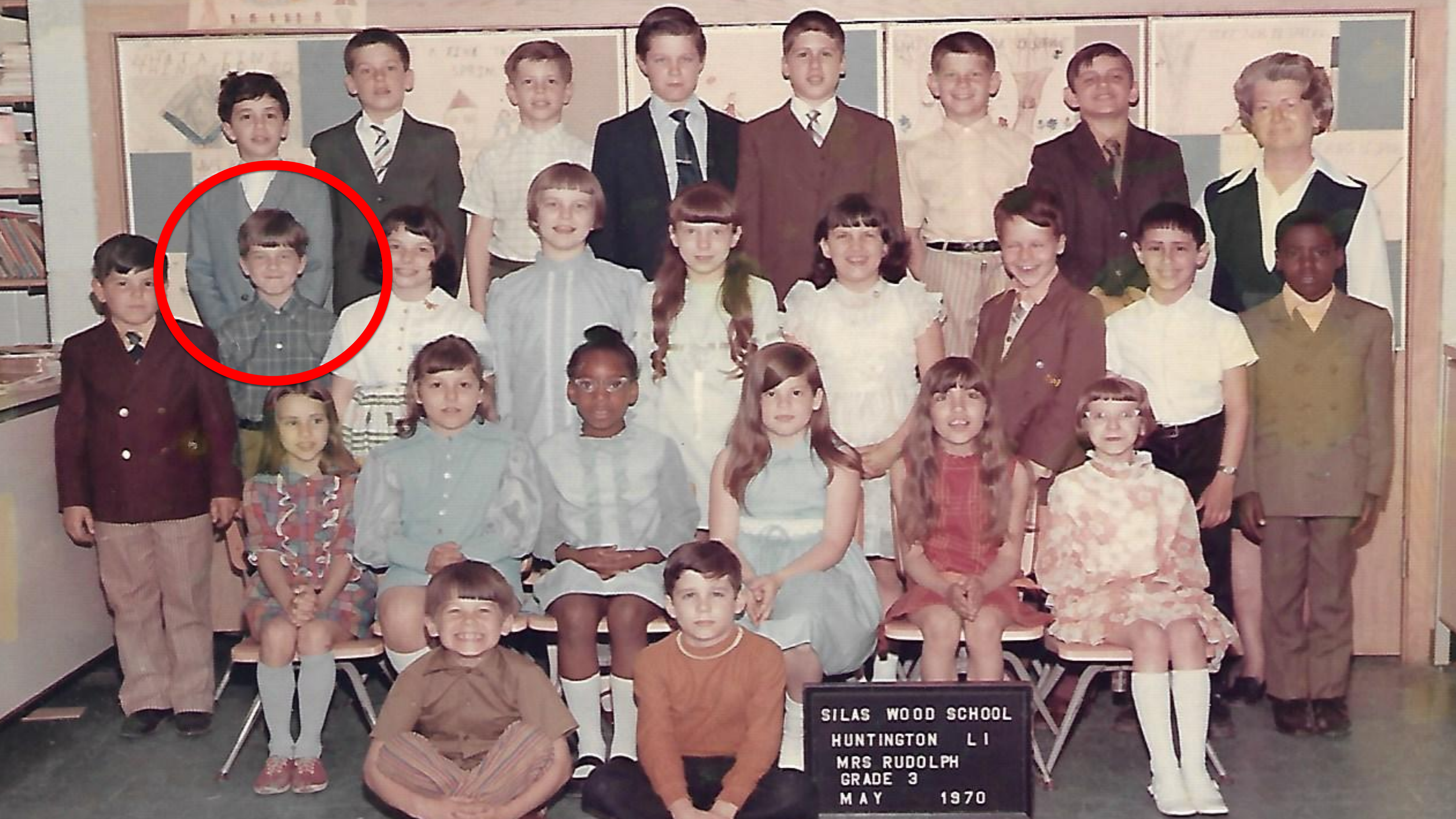
SILAS WOOD SCHOOL HUNTINGTON L I MRS RUDOLPH GRADE 3 MAY 1970