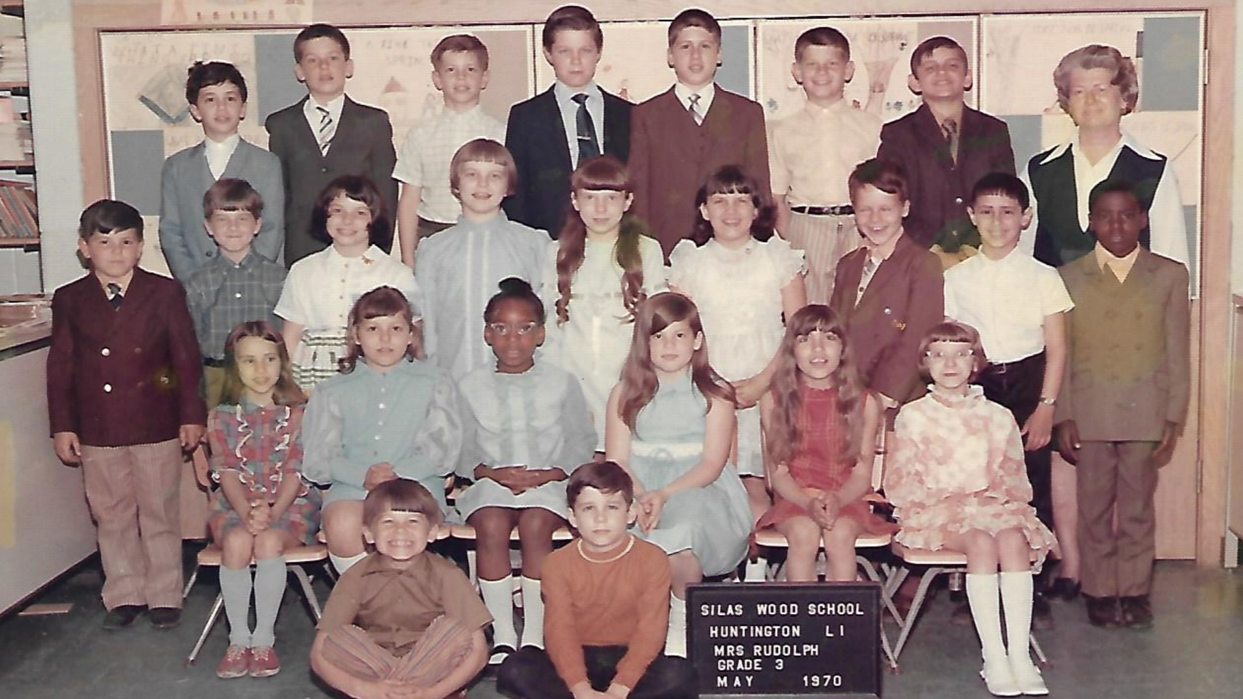
SILAS WOOD SCHOOL HUNTINGTON L I MRS RUDOLPH GRADE 3 MAY 1970