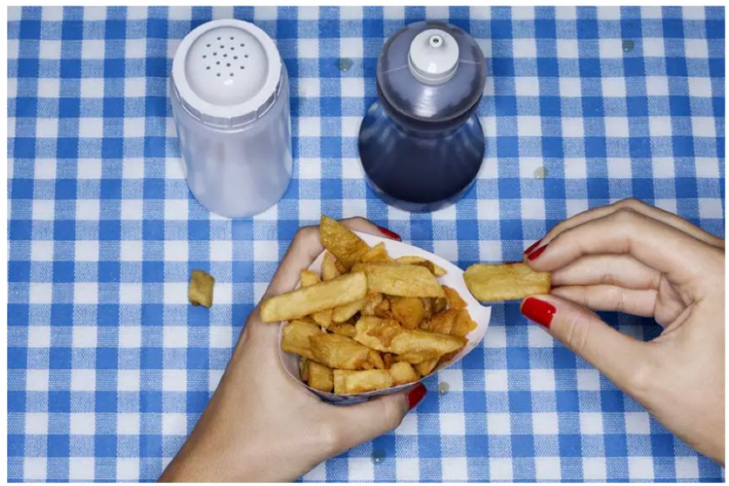
Mmm... taste that delicious starch